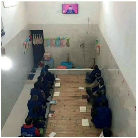
With regards to the specific allegations of forcing Muslims to eat pork, Tangen said that he did not know whether the information was "factual", but if it was taking place it was not the result of "central government policy."

The documents seen by Al Jazeera are among a cache that also detailed the alleged sterilisation programme reported by AP.